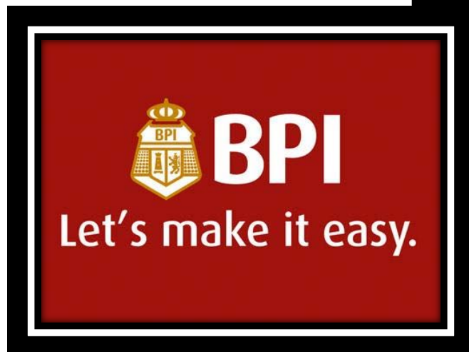
BPI Over the Counter