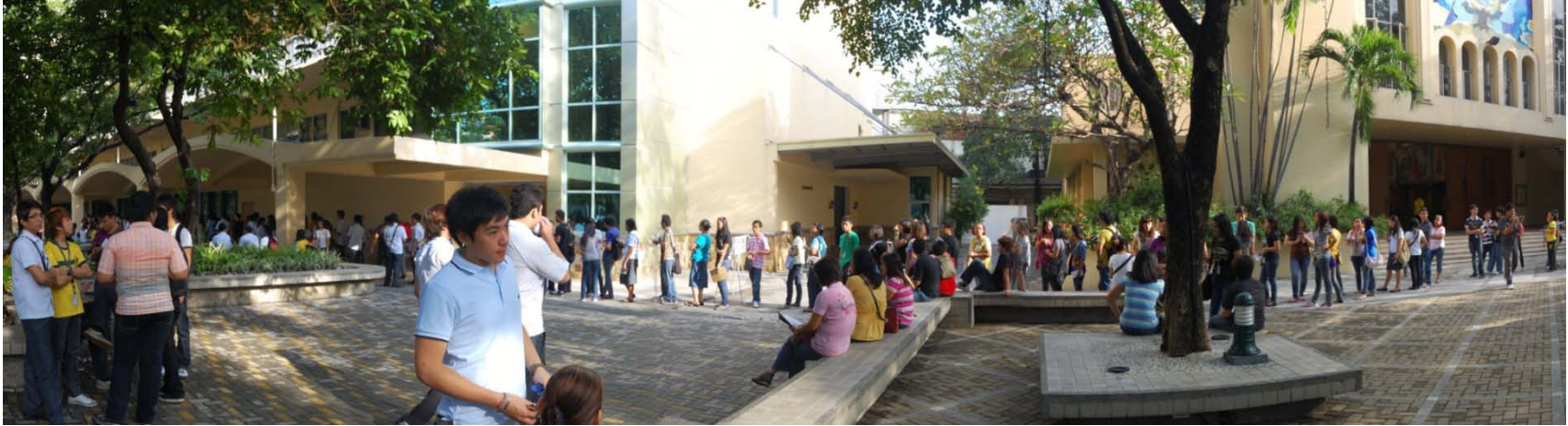
Queue on campus