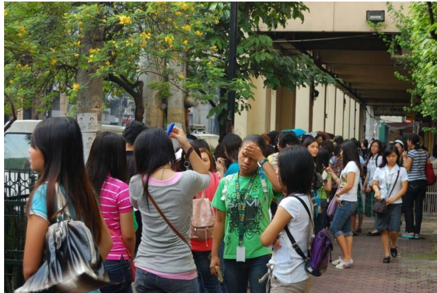
Queue at BPI Morayta